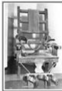
The true story of a man who went to the electric chair as a result of drinking

The true story of this 53-year-old man is told in the booklet, "The Finished Product Of The Brewers' Art." The story is not pretty, but it is true.