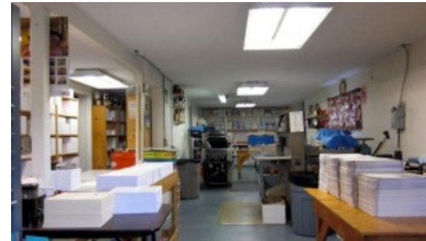
Front view of print shop