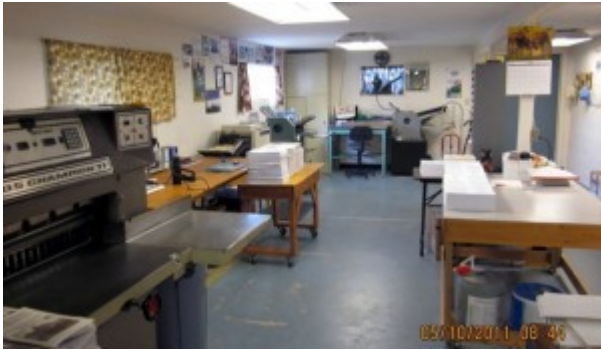
Back view of print shop

THE PEOPLE includes Fundamental, Independent Baptist missionaries and supporting churches who use only the Authorized Version of 1611, holding to the position that it is God's preserved Word in English.